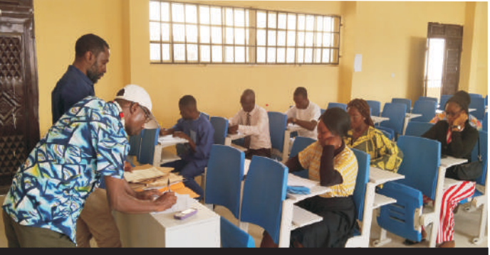
CIPESS Procurement Officers & a Section of Bidders and ObserversDuring a Bid opening Ceremony in CIPESS JOSTUM