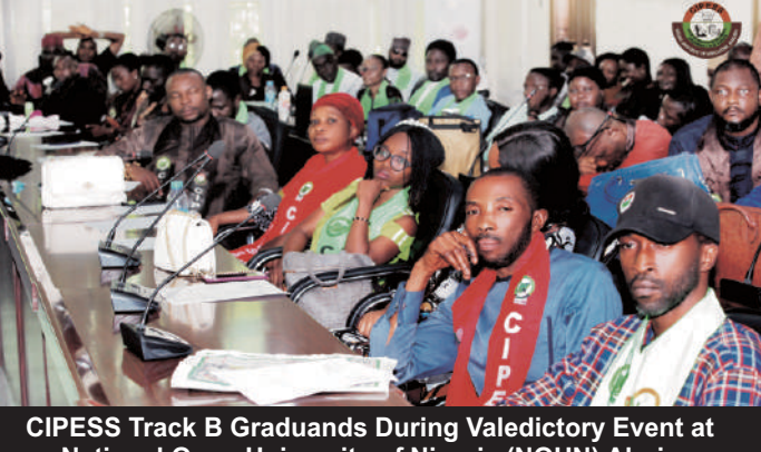
National Open University of Nigeria (NOUN) Abuja