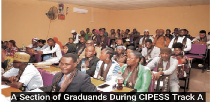
A Section of Graduands During CIPESS Track A graduation Event in Kogi State