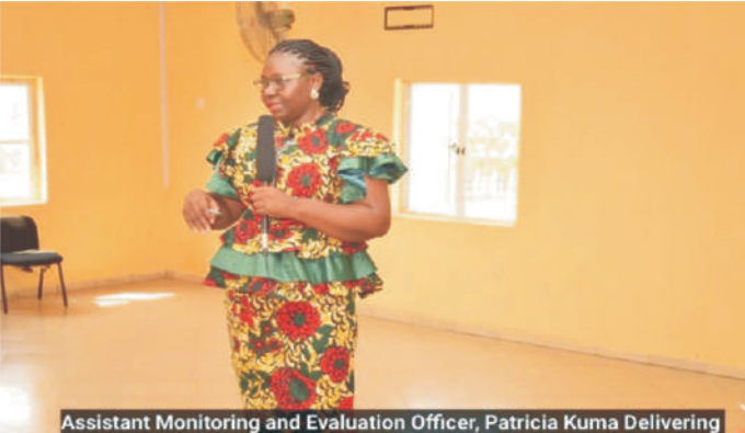
a Lecture During CIPESS Track A Grduation Event in Kogi State.